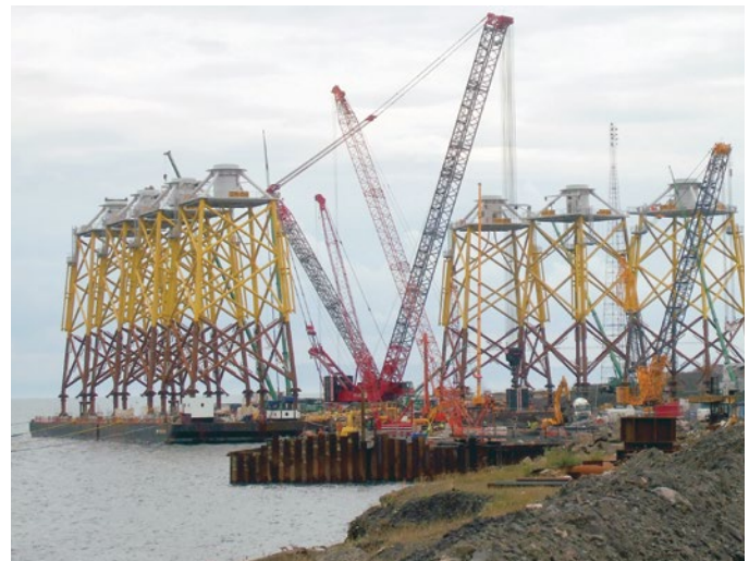
Interzone® 1000 is widely used in the offshore wind industry