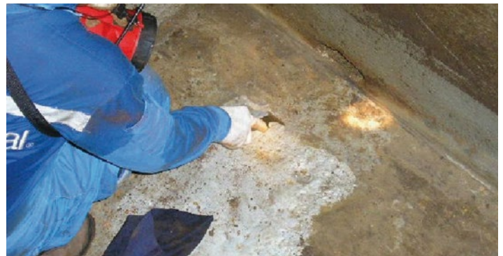
Pitted bottom plate in crude oil tank after 6 years service. Intershield® 300 is still in excellent condition other than dirt and oil stains.

www.international-pc.com pcmarketing.americas@akzonobel.com