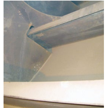
Excellent long term performance in the water ballast tanks after 15 years in service. Intershield® 300 shows no breakdown on edges.