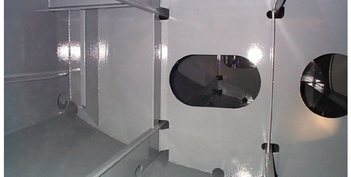
Intershield® 300 after application.