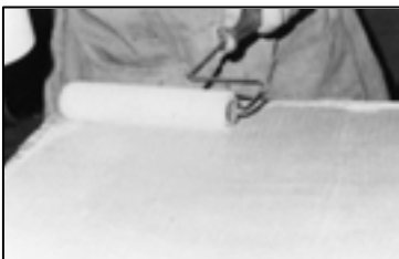
Saturating Mat/Cloth with Roller

Roll or brush the dry mat/cloth until the basecoat starts to come through. The saturating liquid is best applied with a roller or large brush. At overlap, the top lap of mat/cloth should be lifted so that saturating liquid can be applied to the bottom layer. The top layer is then pressed on the bottom layer and saturated. Saturation is complete when all the areas of the glass mat/cloth have lost their whiteness and have become slightly translucent.