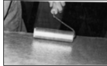
Rolling Mat with Ribbed Roller

When chopped strand mat is used in lieu of cloth reinforcement, the fiberglass must be rib rolled immediately after saturation to remove entrapped air.