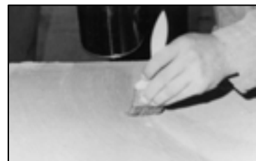
Saturating Mat/Cloth with Brush

The topcoat should be applied approximately 1/16" thick (60-65 mils), troweled as evenly as possible, and then smoothed lightly with a brush or short nap roller dampened with Styrene Smoothing Liquid.