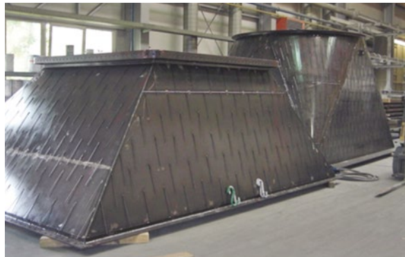
Flue gas ducts and hoods

In cases where solid particles may contribute to additional abrasion, Ceilcote® 282AR Flakeline employs a abrasion resistant ceramic filler to provide additional protection.