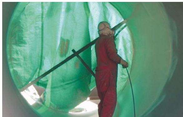
Installation of Ceilcote® 232 Flakeline

To ensure flexible application across a range of substrates a family of ancillary materials are available to support this range.