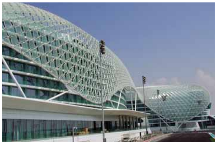
Yas Hotel, Abu Dhabi, UAE

Unless otherwise agreed by us in writing, any contract to purchase products referred to in this brochure and any advice which we give in connection with the supply of products are subject to our standard conditions of sale.