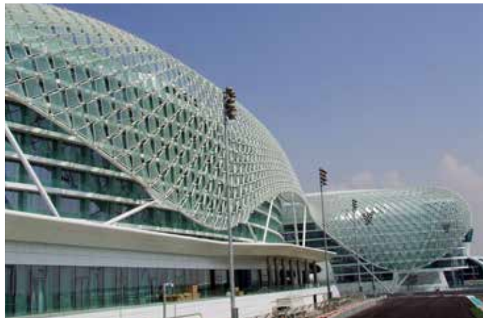
Yas Hotel, Abu Dhabi, UAE

Unless otherwise agreed by us in writing, any contract to purchase products referred to in this brochure and any advice which we give in connection with the supply of products are subject to our standard conditions of sale.