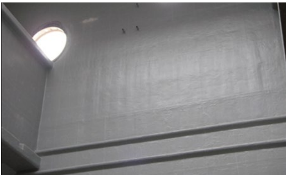
Completed Ceilcote® 242 Flakeline installation