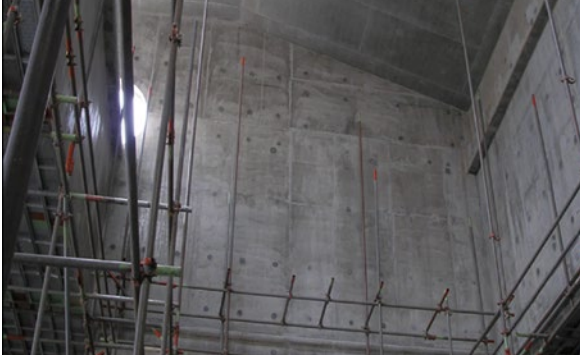
Concrete seawater FGD

Ceilcote® 242/242AR/242HT Ceiline utilizes an elastomeric epoxy basecoat to provide additional crack bridging up to a maximum crack width of 1.32 in (1mm).