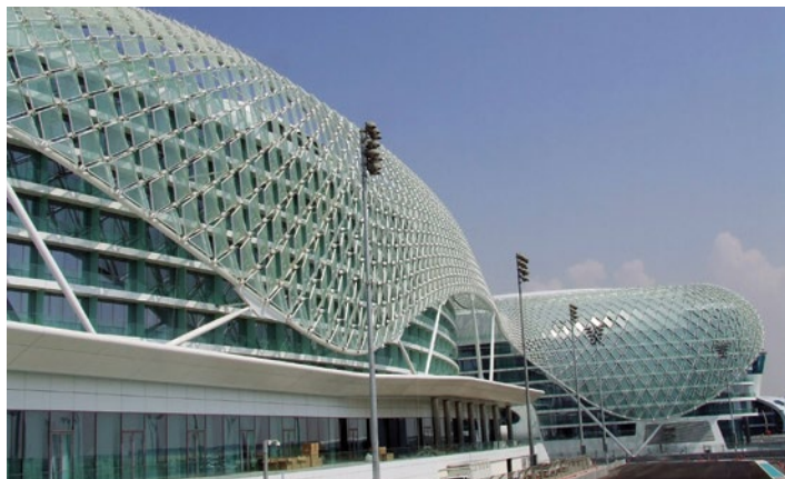
Yas Hotel, Abu Dhabi, UAE

Unless otherwise agreed by us in writing, any contract to purchase products referred to in this brochure and any advice which we give in connection with the supply of products are subject to our standard conditions of sale.